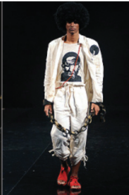
Nossa Senhora do Patrocínio